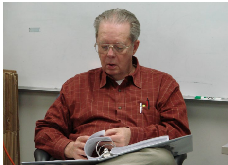
Respectfully submitted, Jennifer Barritt