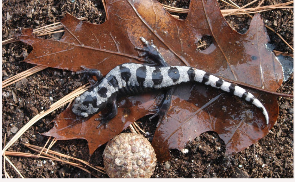
Ambystoma opacum or Marbled Salamander adult.

While this program was simple enough to get off the ground within the division, much work was done behind the scenes to make sure that we adhered to state and federal laws and followed industry cleanliness standards for amphibian safety. A formal request was sent to the Virginia Department of Game and Inland Fisheries (VDGIF), followed by detailed scientific plan of when, where and why we wanted to conduct the survey, what species were to be surveyed, what types of collection methods would be utilized, who was allowed to collect and qualifications did they possess. After all was said and done, we were approved for two years of observation for larval and adult Ambystoma opacum salamanders and all aquatic insects. The permit also covers Gambusia holbrooki for capture and relocation which when used correctly can bolster our bio rational program as well.