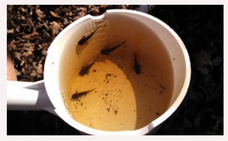
Ambystoma larvae found in Hampton in 2017.

Keep an eye out for these little guys while dipping for spring larvae in vernal pools and ditches. They are a great indicator of our aquatic environmental health and they may just assist you in mosquito control as well!