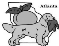
Golden Retriever Club