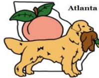
Golden Retriever Club