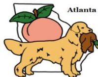
Golden Retriever Club