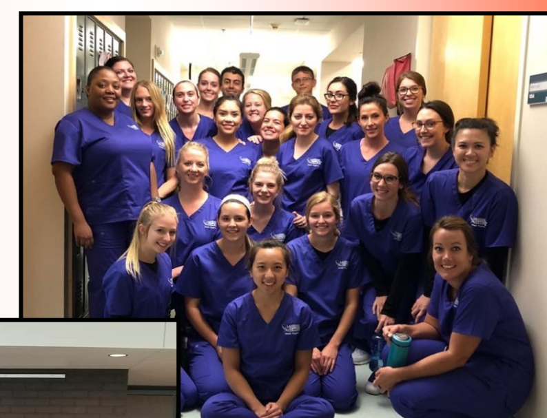
Kellogg Community College