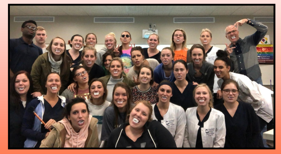
Grand Rapids Community College