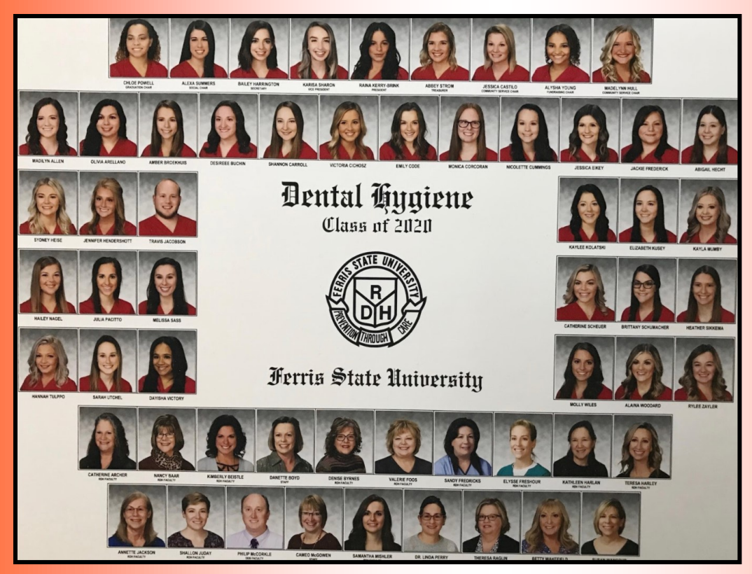
Ferris State University