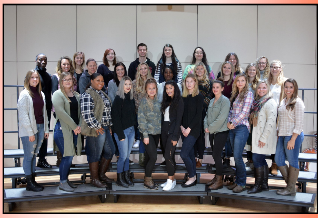
Mott Community College