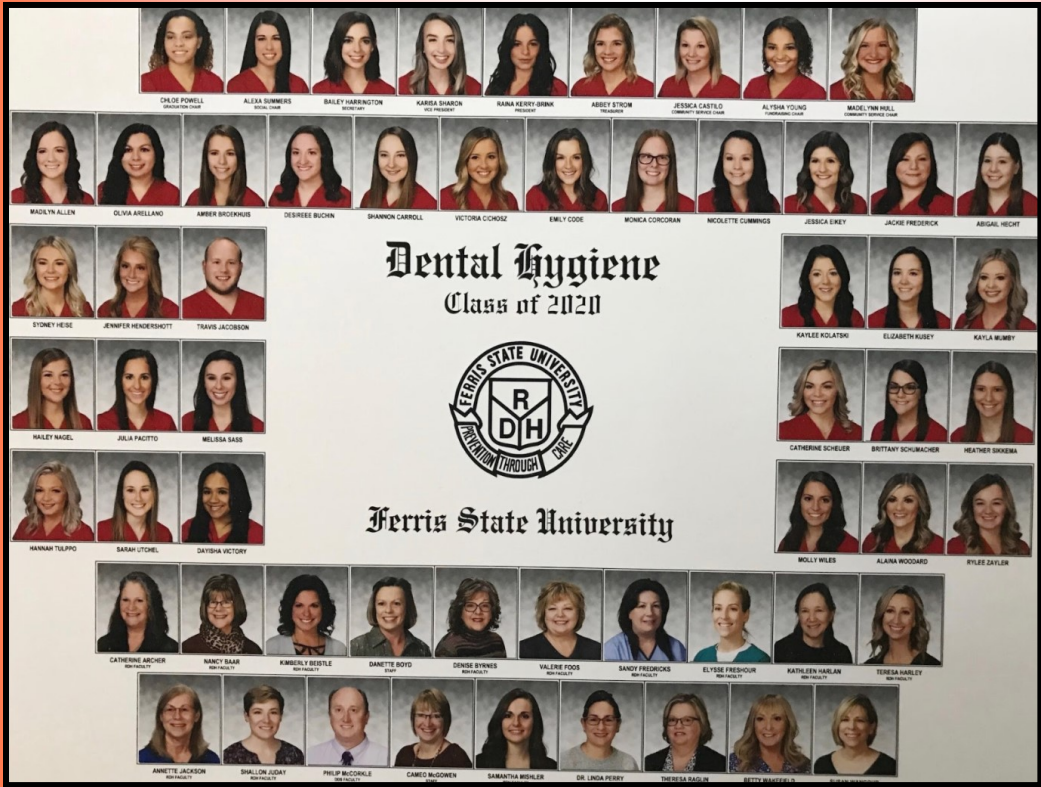
Ferris State University