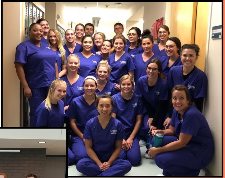
Lansing Community College