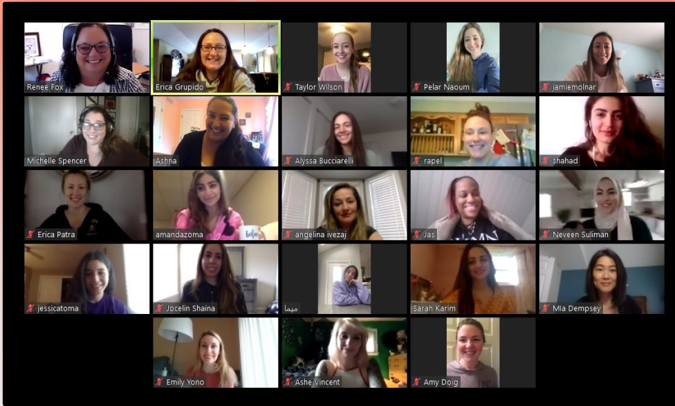
Oakland Community College