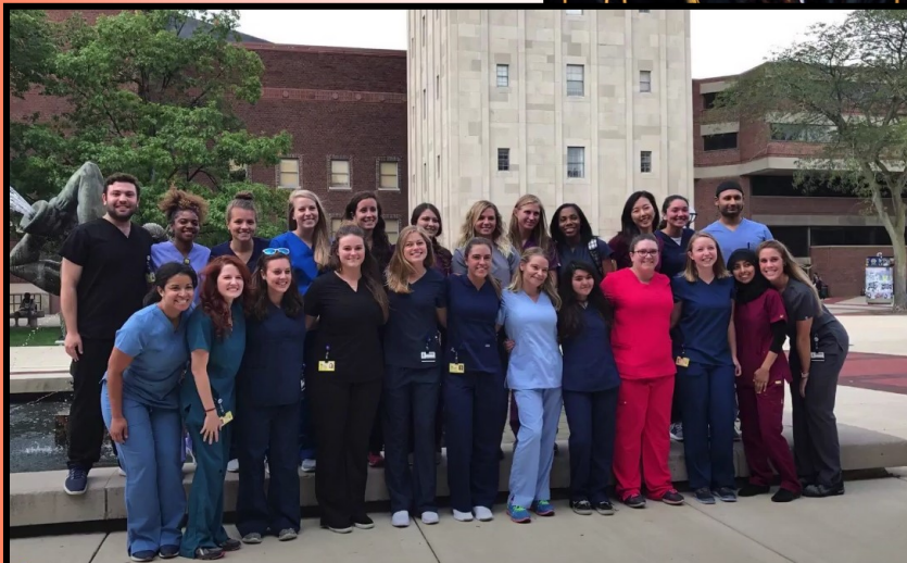
University of Michigan