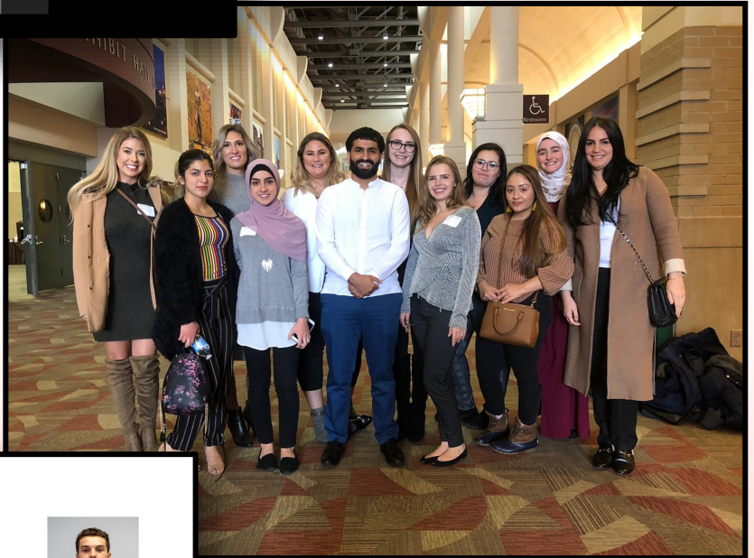
Wayne County Community College