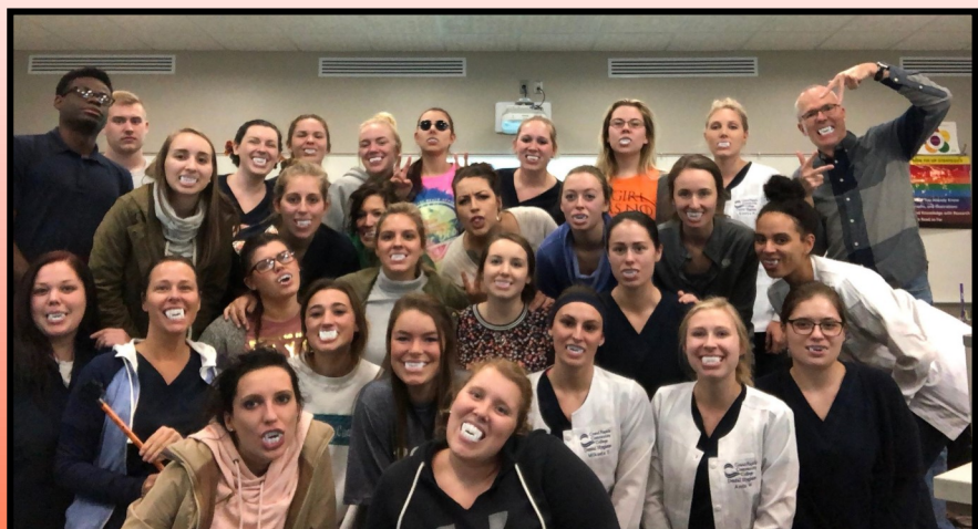
Grand Rapids Community College