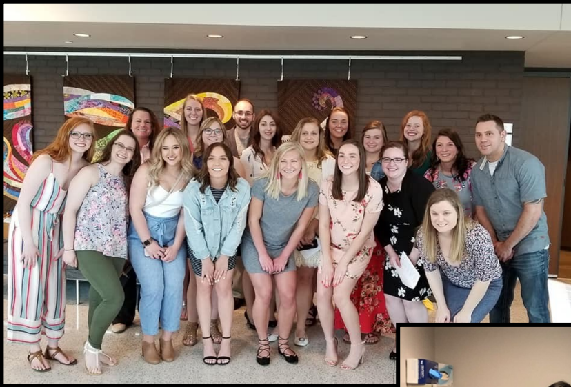
Kellogg Community College