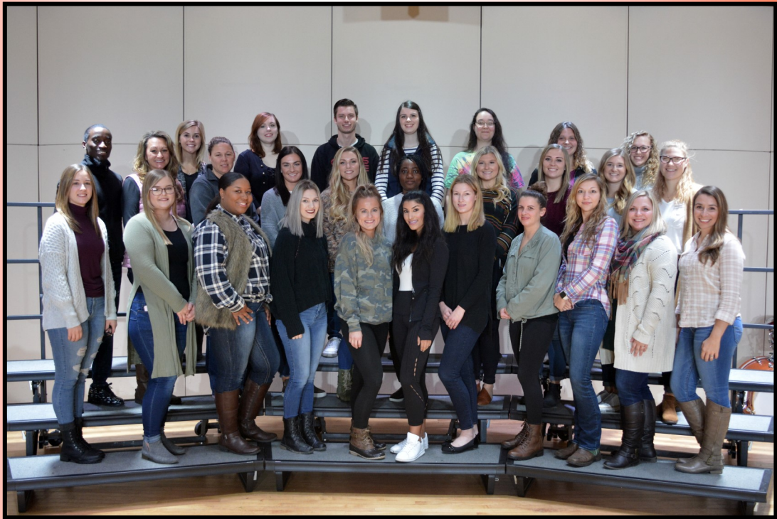
Mott Community College