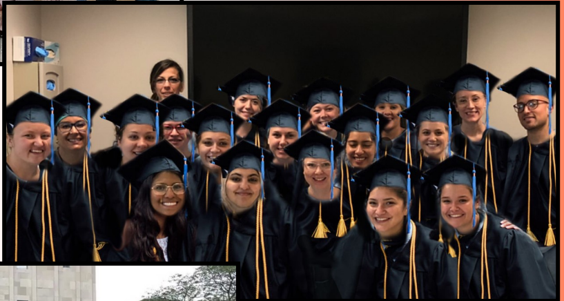
Kalamazoo Valley Community College