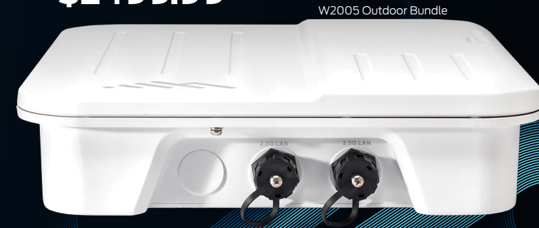
W2005 Outdoor Bundle