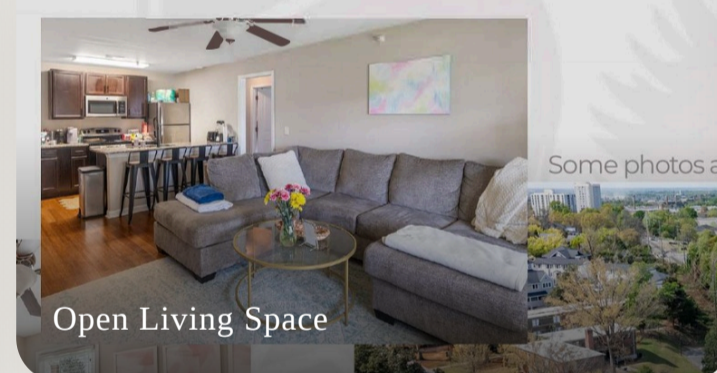
Open Living Space

many years to follow. This is your chance, duation.