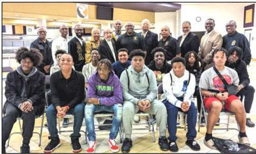
Pictured: Alpha Men and Mentees at Project Alpha

Company or Individual Sponsor signage at your hole and recognition at golf dinner.