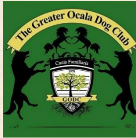
AKC Member Club

Come see the new leveled track with permanent fencing