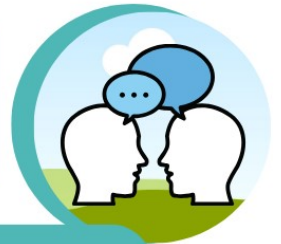
Exhibit Hall/Poster Presentation