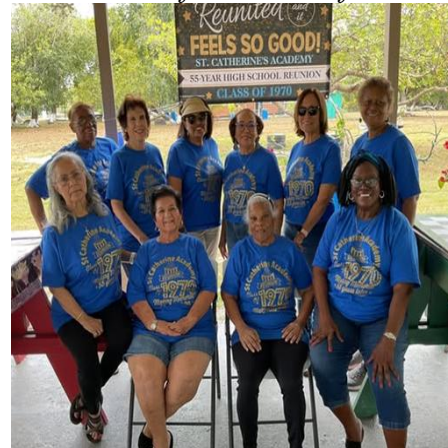
Members of the Class of 1970