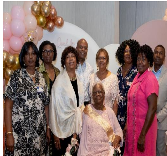
Mama and her children

“Thanks to everyone for the memories. I will cherish them for however longer I will be on this earth. When my Father calls me, I am ready. I have lived a good life. Like Paul, I can say, ‘I have fought the good fight, I have finished the race, I have kept the faith. Now there is in store for me the crown of righteousness, which the Lord, the righteous Judge, will award to me on that day...’” 2 Ti 4:7-8 NIV