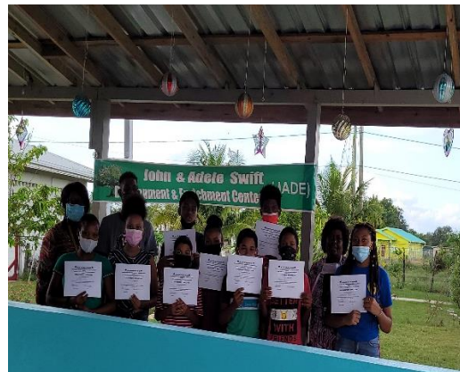
Students earned Certificate for successful participation in the event.

Notes from students following the event: