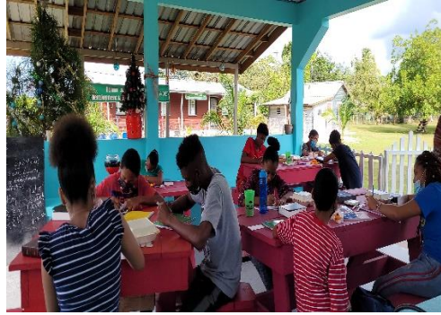
Students finalizing their notes before presentation.

A youth event for the high school students who are sponsored by JADE was held on December 21. Students commented that online schooling was challenging because of the lack of or intermittent Internet services. However, they completed their assignments even if it meant giving up their weekends. They reviewed their goals for success and the steps needed to experience success in school. After the academic tasks were accomplished, they participated in team building activities, including skits and games.