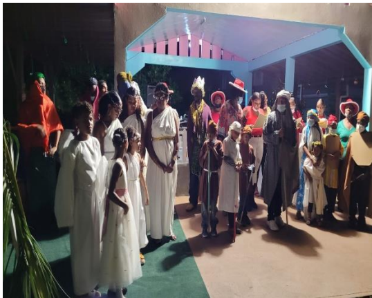
Cast of the Christmas Play

The ladies in the Bible Study Groups prepared a Christmas play reenacting the birth of the Son of God. They joined their children and/or grandchildren as cast members. They practiced diligently during the months of October and November. Adhering to COVID restrictions, the performance was held outdoors on December 18, with over 60 guests in attendance. God blessed us with great weather, and we rejoiced that all members of the cast were in good health. Everyone performed commendably, all to the glory of God. Amen.