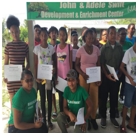
Certificate of Participation