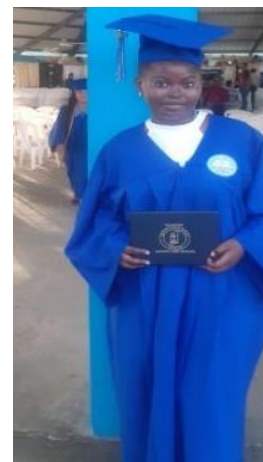
Meika Palacio Belmopan Baptist High School

"A river cuts through rock, not because of its power but because of its persistence." Proverb