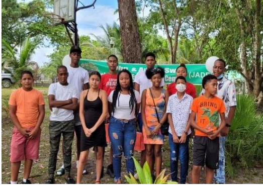
Group of high schoolers; illness kept others away.