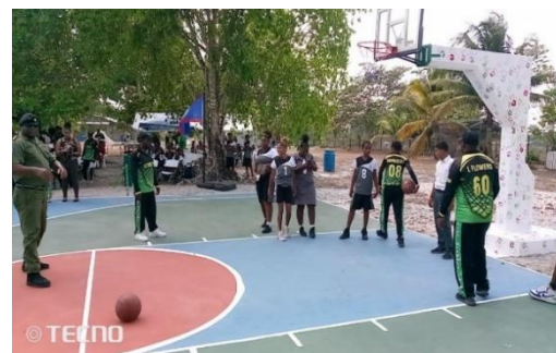
Students tested their skills on the court