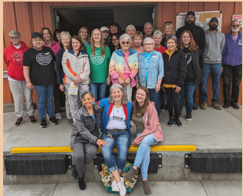
A picture of our Thursday crew on our new loading dock!