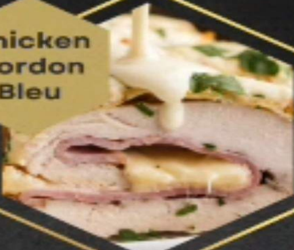
Chicken Cordon Bleu