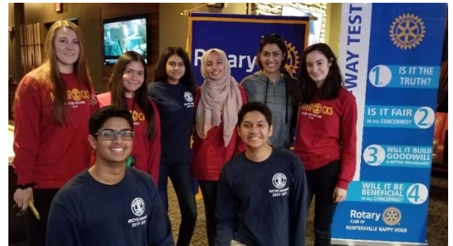
Interact Club Mallard Creek High School

8 members from the 75 member Interact Club visited and told us who they are, what they do in their club and their future plans. We are so proud to sponsor these students.