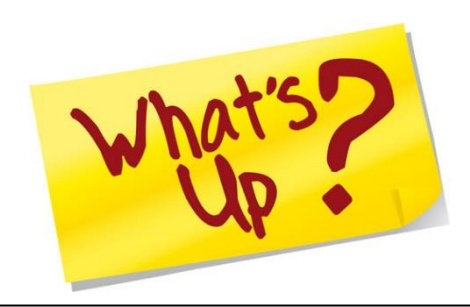
What are our Rotarians up to while staying at home?