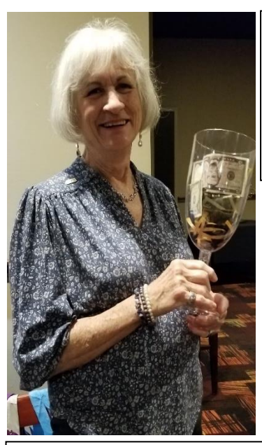
Club Service Happy Birthday

Huntersville Happy Hour Chartered June 16, 2014