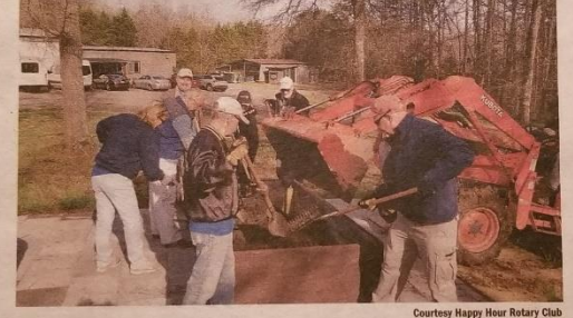
Huntersville Rotarians work on a combined patio and planter box project they created at Hinds' Feet Farm last month.

project, spearheaded by club $8,000. Franken has