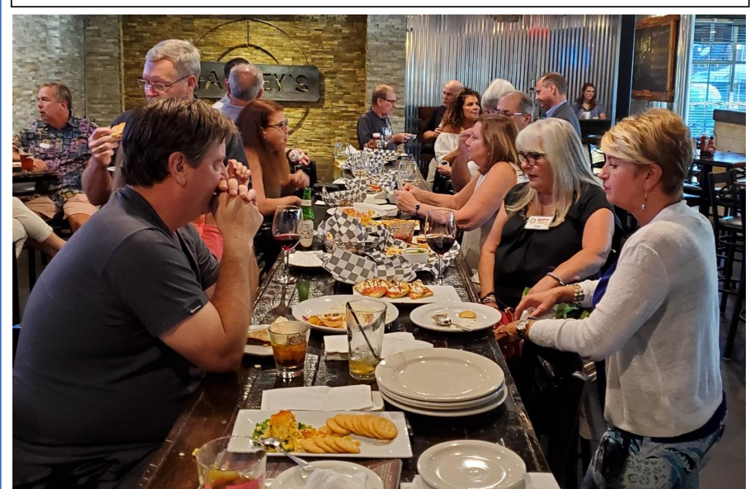
Are you ready for Fall, Football and Fun

Social at 5:30 pm at Harvey's Bar & Grill, 19906 North Cove Road, Cornelius