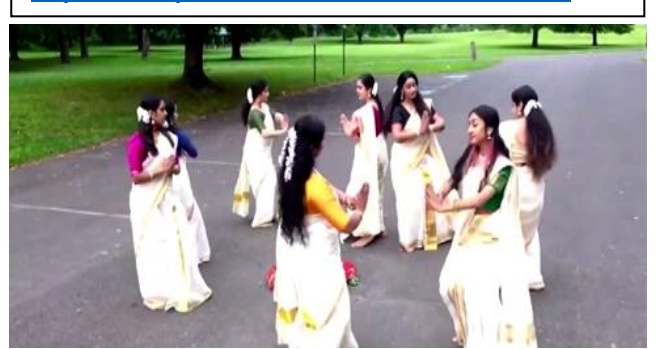
Explanation of the Onam Festival: https://www.prokerala.com/festivals/onam.html