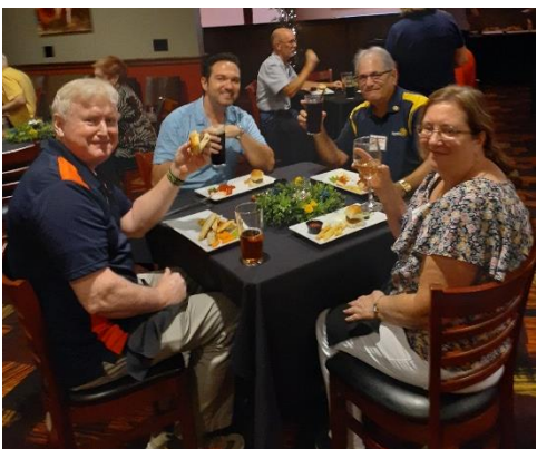
Thriss Central 3201