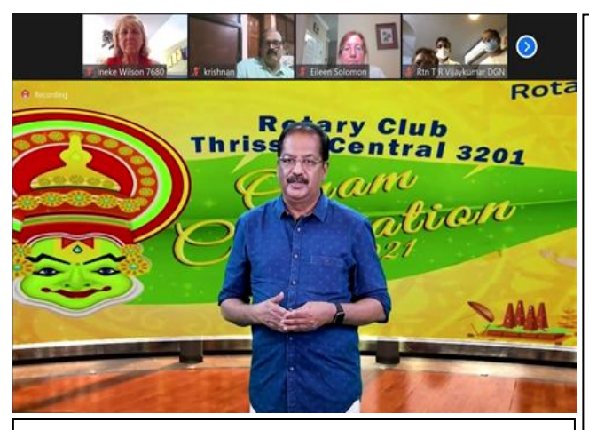
Explanation of the Onam Festival: https://www.prokerala.com/festivals/onam.html