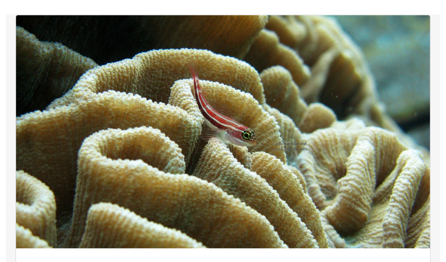
Is Fish "Brain Food" for Older Adults?

Why has fish consumption been associated with cognitive impairment and loss of executive function?