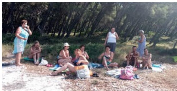
Women war survivors take a break at Seka House.

This retreat center on the island of Brac is booked from May through September every year. Activists from across the region use it for recreation, strategic planning or seminars. Groups such as the Serbian, Croatian and Bosnian survivors of the war who testified in the Women's Court, women from the shelter in Zagreb, and Women In Black from Belgrade use the facility. Each August a group of activist lesbians from the region spend a week or two tending to the garden and sprucing up the facility with a fresh coat of paint. After mornings working on the facility, they are free to enjoy the beach. This is a rare treat for women who can't afford to take vacations. We encourage