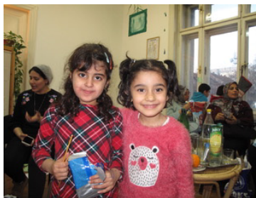
Daycare and Croatian lessons are provided at support group for refugee women and their children.

The Center continues to work on sex trafficking, domestic violence, refugee support and the support of women war survivors. It's an ambitious work plan for an organization with a reduced staff and reduced funding from the government. The Center runs a group for refugee women and their children. Most of the women are Syrian, Iraqi and Kurdish. The Center also helps members apply for asylum status. Once one achieves this status, the government will provide for an apartment for two years.