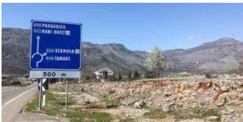
Bona Fide has also been supporting over 4,000 refugees who have passed through their town.