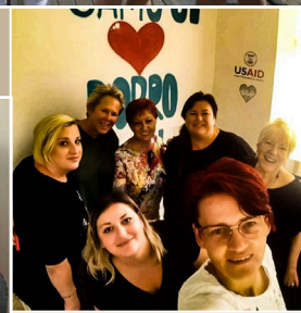
Special moms (moms with children with disabilities) gather to share challenges and triumphs.