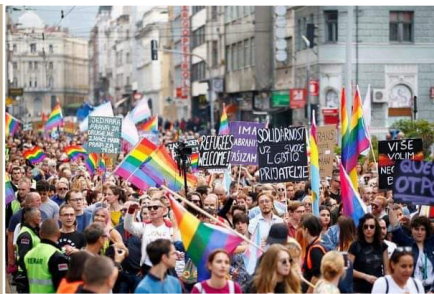
More than 3,000 people attend Bosnia's first LGBTQ Pride March in Sarajevo.