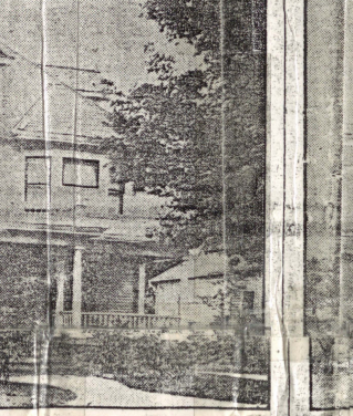
Argos Public School.

ty that awaited them at their journey's end. A mental image of a home surrounded by fertile acres shortened the length of each weary mile.