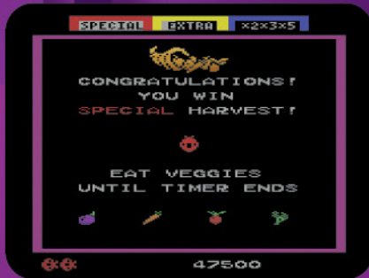
Veggie Bounty Harvest!

Collecting a letter that is in the word SPECIAL when it is RED will highlight that letter in the Status Display. If you can collect all seven letters in the word SPECIAL , the current level ends, the SPECIAL letters are reset, and your ladybug will earn an invite to the Veggie Bounty Harvest! This is a special maze with no enemies and lots of veggies: