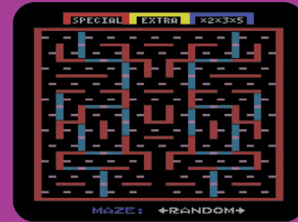
Maze selection screen - random

Move the joystick LEFT or RIGHT to rotate through the maze selection options: