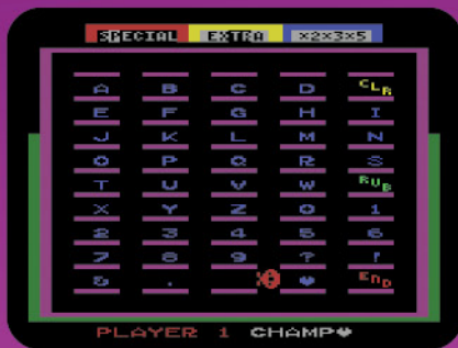
High Score Entry screen

When a player's game is over, if a high score has been achieved, the HIGH SCORE ENTRY screen will be displayed: