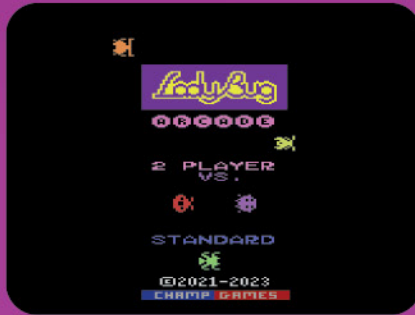
Title screen with game options

Move Player 1's joystick LEFT or RIGHT to switch between the skill levels: NOVICE , STANDARD , ADVANCED and CHALLENGE .