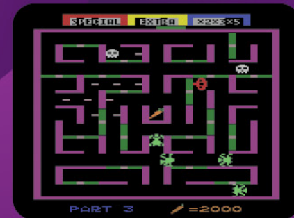
Veggies are good for you!

Once all four enemies have entered the maze, the bonus veggie that was displayed on the START screen will appear in the enemies' home base. If you manage to eat the veggie, you will earn big points, and the enemies will be stunned for a few seconds, giving you a chance to escape and retreat to a safe area.