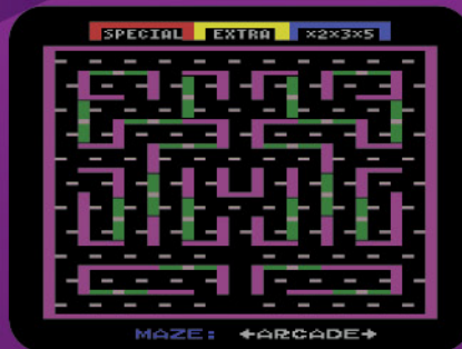
Maze selection screen - arcade

At the beginning of a new game, you can select which maze (or mazes) you would like to play. There are four unique mazes (including the arcade maze), plus there are options for playing with all four mazes either in order or randomly.