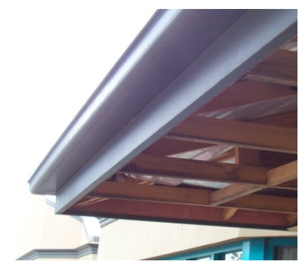
An example of a roof requiring new eaves linings after damage caused by water overflowing from the eaves qutters.

No eaves gutter system should, when overflowing allow water to enter the walls or internal structure of a building.