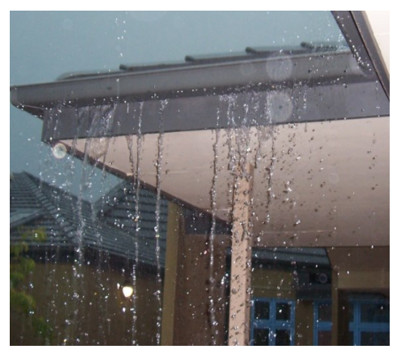
An example of rainwater overflowing from the eaves gutters during a storm event.

Eaves gutter systems, including downpipes, shall be designed and installed so that water will not flow back into the building.