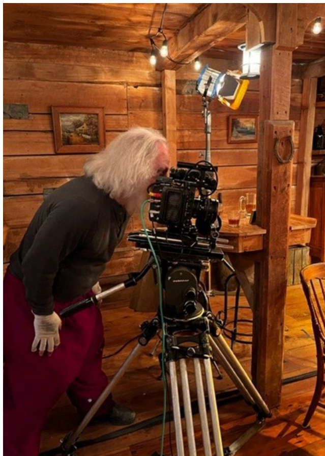
On Set BTS: Hope for Christmas