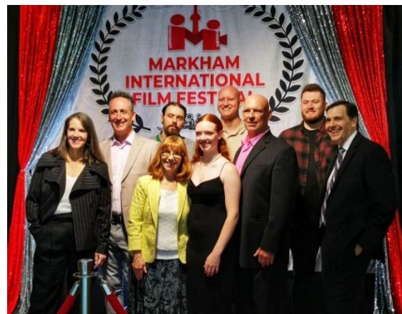
Cast and Crew on the Red Carpet