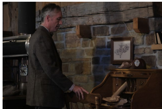
On Set Scene: Hope for Christmas