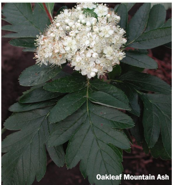
Oakleaf Mountain Ash