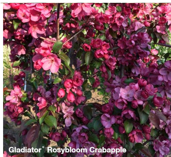
Gladiator® Rosybloom Crabapple