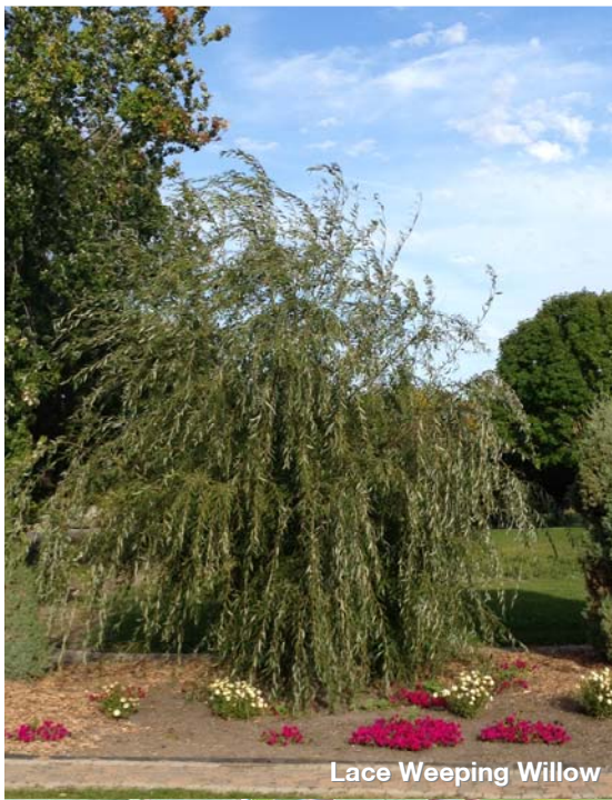
Lace Weeping Willow