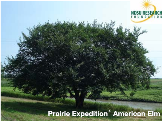
Prairie Expedition ® American Elm

A North Dakota selection of American Elm with a high level of resistance to DED. Classic dark-green foliage and umbrella-shaped crown. NDSU introduction.