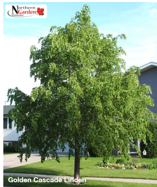
Golden Cascade Linden

A hardy selection of Littleleaf Linden noted for its rapid growth, resistance to leaf spot, leaf gall, and improved resistance to sunscald. Developed by Jeffries Nurseries. USPP #8,239.