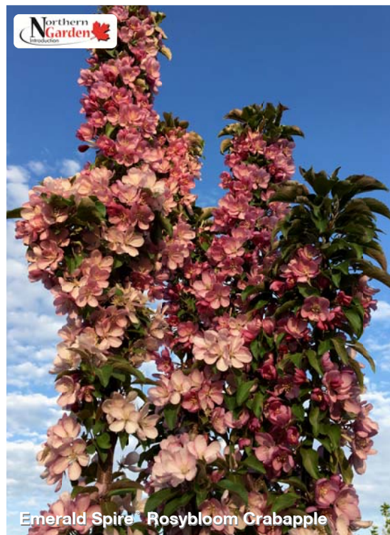
Emerald Spire® Rosybloom Crabapple

A flowering crabapple with oval crown and leaves that turn deep purple during the growing season. Small red fruit in late summer. Resistant to fireblight.