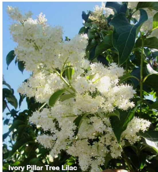
Ivory Pillar Tree Lilac

This small tree has cherry-like bark, glossy foliage and spectacular creamy-white, fragrant flowers that bloom in June. No disease or insect problems. A Sheridan Nursery introduction.