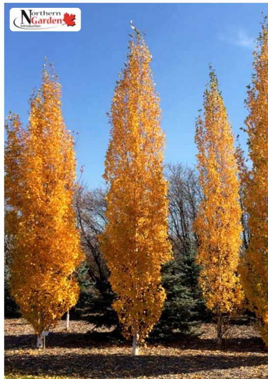
Parkland Pillar® Asian White Birch

Fragrant, double white spring flowers turn pink with time and are followed by showy red fruit in fall. Glossy, deep green, disease resistant foliage.