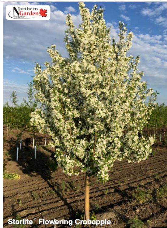
Starlite® Flowering Crabapple