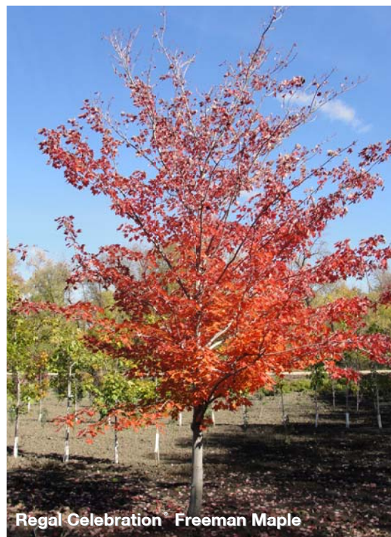
Regal Celebration Freeman Maple