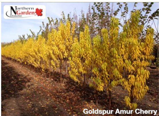
Goldspur Amur Cherry