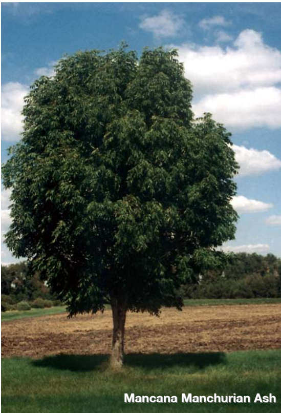
Mancana Manchurian Ash