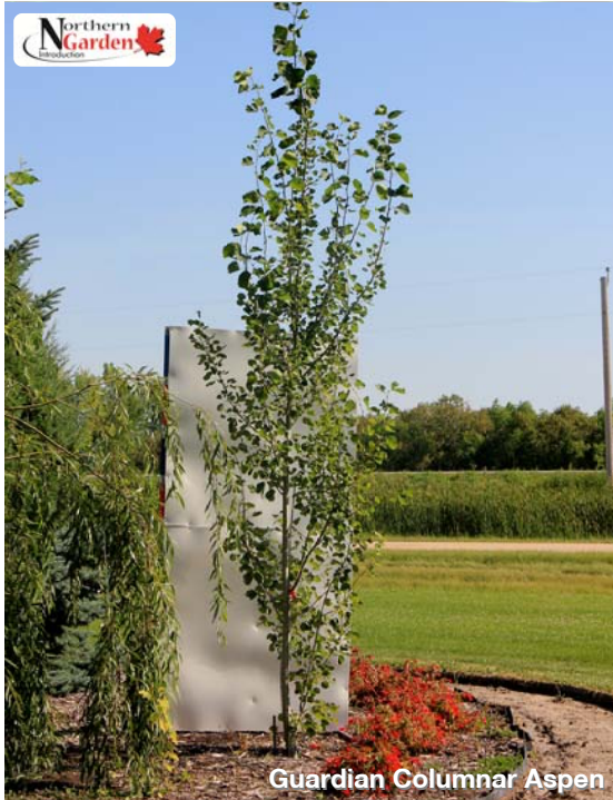
Guardian Columnar Aspen