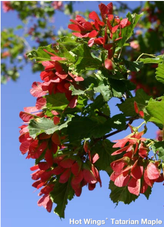
Hot Wings ® Tatarian Maple