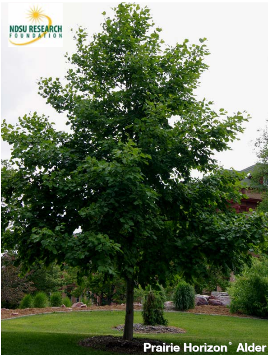
Prairie Horizon ® Alder