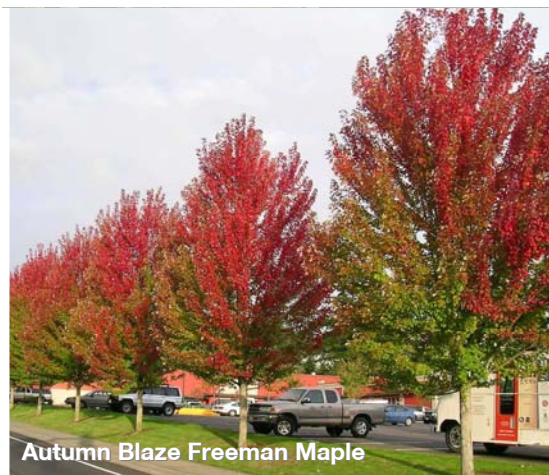
Autumn Blaze Freeman Maple