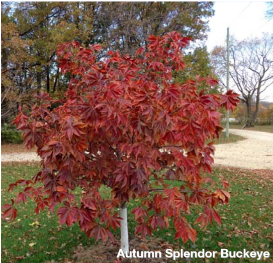
Autumn Splendor Buckeye