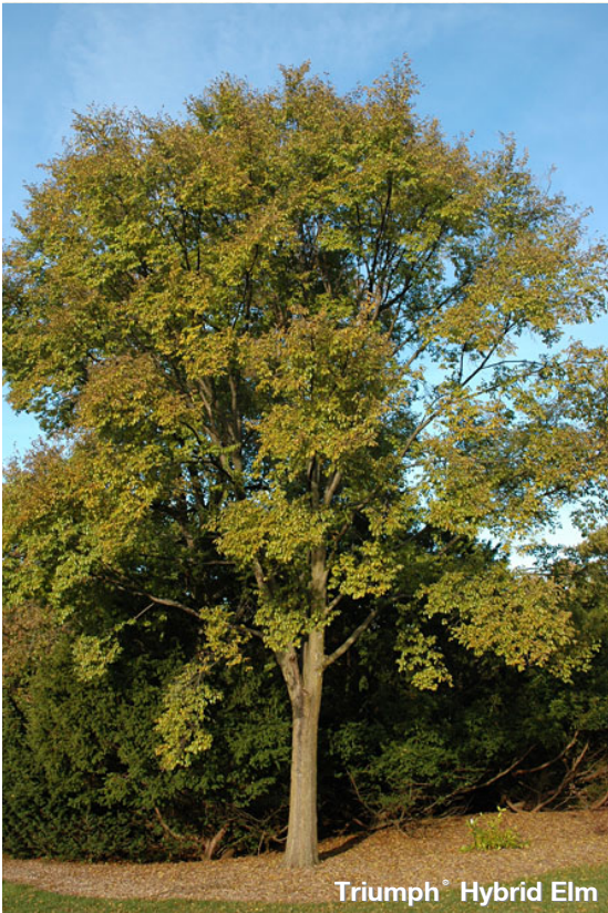
Triumph ® Hybrid Elm

DED-resistant, hybrid elm with strong branching, dark-green foliage and excellent pest resistance. Derived from a cross between hybrid elm