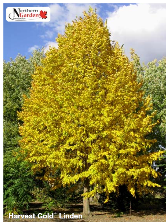
Harvest Gold Linden