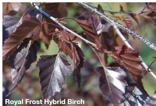
Royal Frost Hybrid Birch