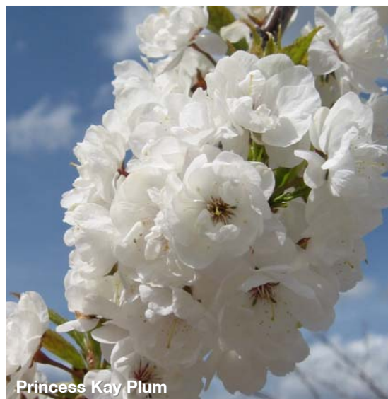
Princess Kay Plum