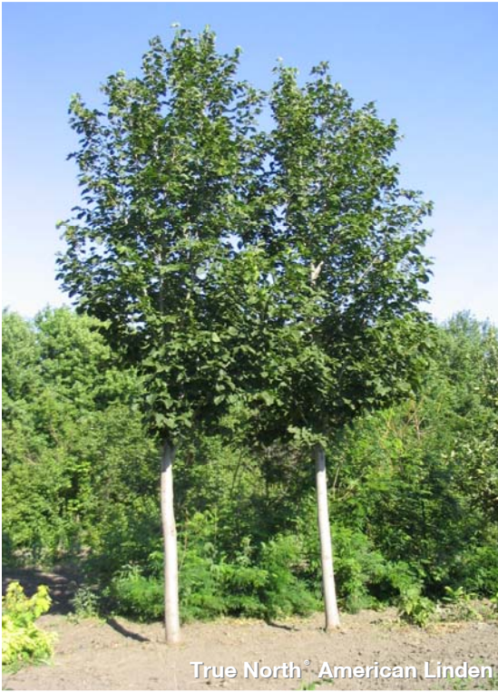
True North ® American Linden