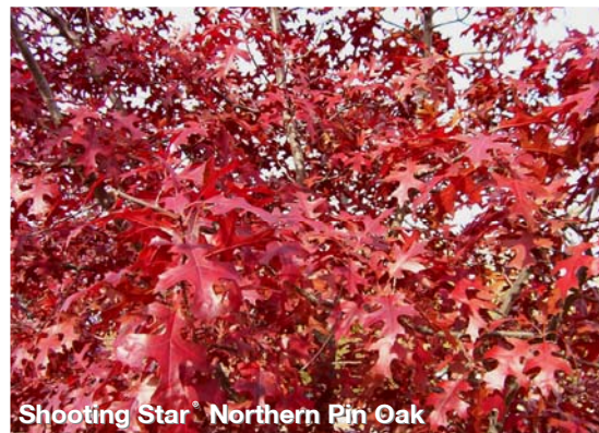
Shooting Star® Northern Pin Oak