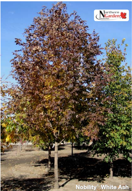
Nobility® White Ash