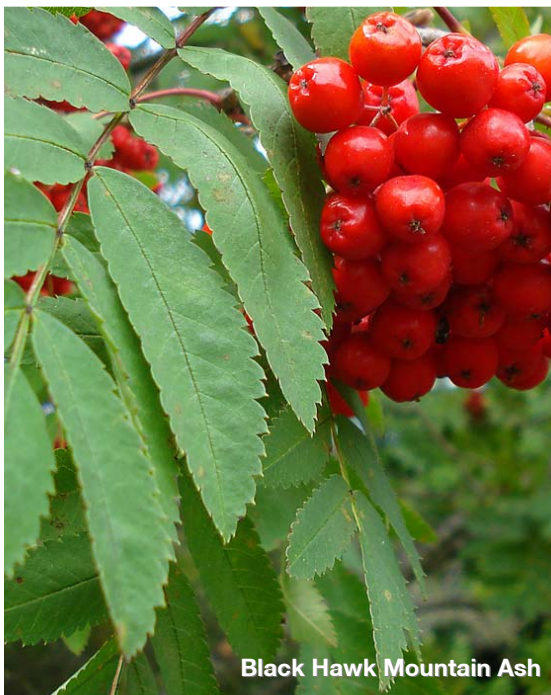
Black Hawk Mountain Ash