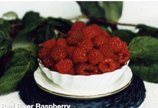
Red River Raspberry