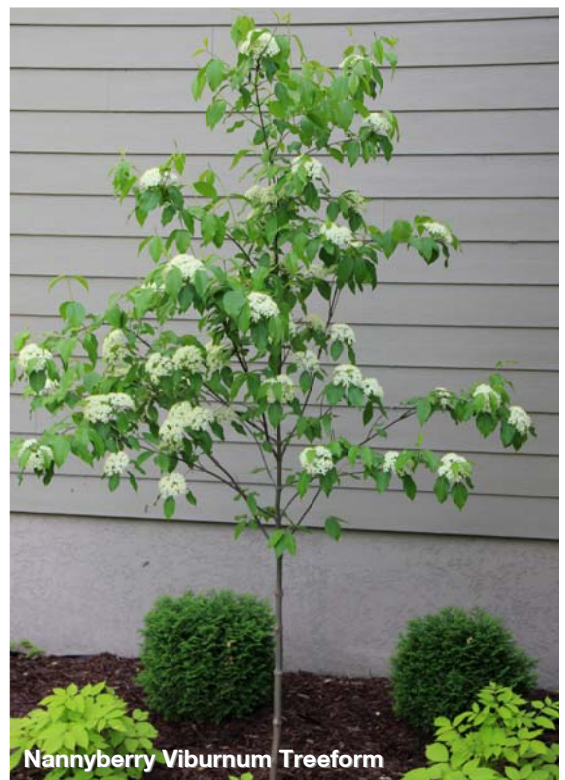
Nannyberry Viburnum Treeform