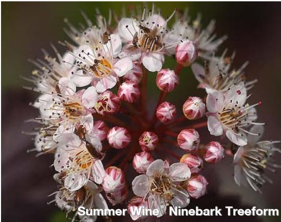
Summer Wine Ninebark Treeform

Fine textured, light green foliage makes this plant look very graceful and elegant. Small yellow flowers in late spring.