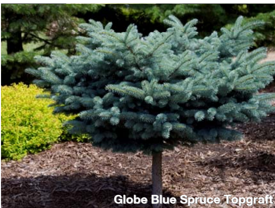
Globe Blue Spruce Topgraft

A tree-formed version of this popular purple leafed ninebark. Creamy white flowers in the spring. Outstanding peeling bark on exposed trunk. Basal pruning will be required to maintain single stem. USPP #11,211