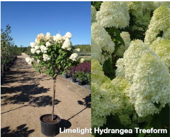
Limelight Hydrangea Treeform

Enormous flower panicles are a blend of vanilla and strawberry in early August. The red colour in these flowers persists for 3-4 weeks. Bailey Nurseries First Editions introduction. Prefers a sheltered location.