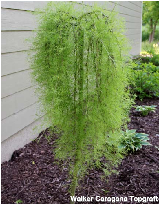
Walker Caragana Topgraft