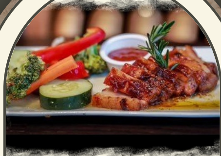
PORK BELLY & PICKLED VEGETABLES

BALSAMIC BRUSCHETTA CAPRESE SKEWERS CAJUN CRAB DIP CHARCUTERIE & CHEESE VEGGIE & HUMMUS PLATTER MINIATURE CRAB CAKES HOUSEMADE POTATO CHIPS SHRIMP COCKTAIL SHRIMP CEVICHE CHICKEN TENDERS TRADITIONAL WINGS BONELESS WINGS