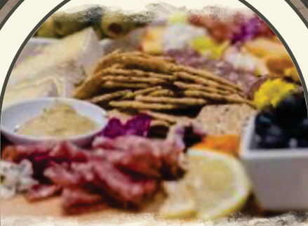
CHARCUTERIE & CHEESE