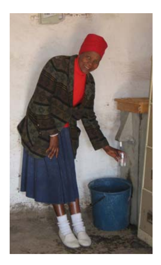
Manz Engineering Ltd. 2703 Cannon Rd. NW Calgary, Alberta, Canada T2L 1C5