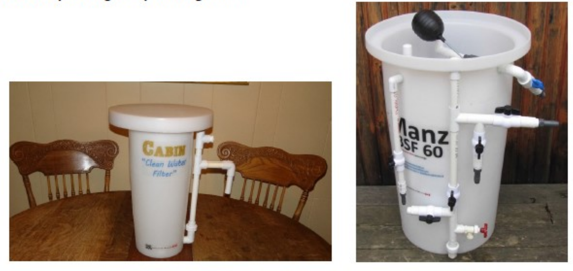
Davnor Water Filters Ltd.: Cabin Clean Water Filter and Manz BSF60 filter.

Available capacities when operating as a biological filter are: 12 LPH and 60 LPH. Capacity of the 12 LPH filter is fixed but the capacity of the 60 LPH filter may be increased to 180 LPH when operating as a polishing filter.