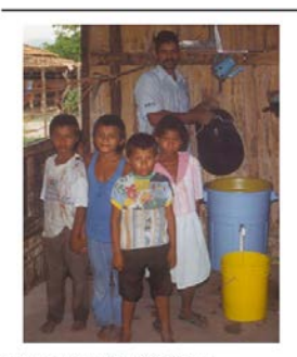
The Canadian Water Filter (CWF) Process The CWF Process is based on a unrease The CWF Process is based on a unique variation of the ver-effective continuous 1 low and filtration process used to treat drinking water throughout the world for over 100 years. The unique design of the CWF allows it to be used as required (i.e. stopped and started) making it ideal for use in individual households. The CWF for humanitarian gurposes is unique and only valiable from Davnor or organizations trained by Density.

The 'Found Filter Design' of the 'Canadian Water Filter' for Humanitarian Use (Also known as the 'BioSand Water Filter'.)