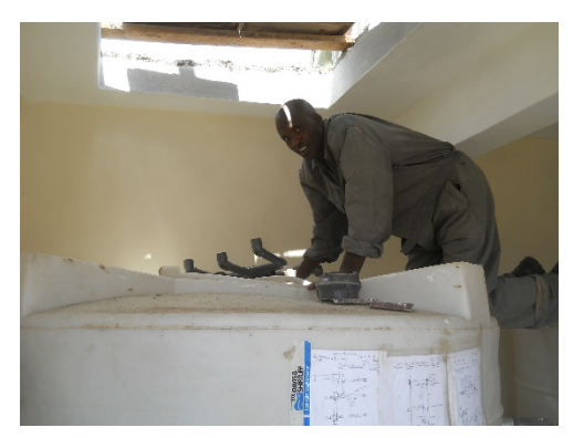
Constructing and installing the MEL filter components.