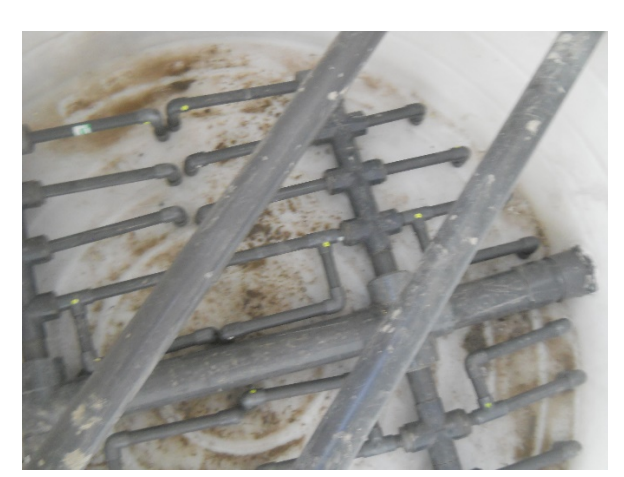
Exterior and interior of MEL filter.