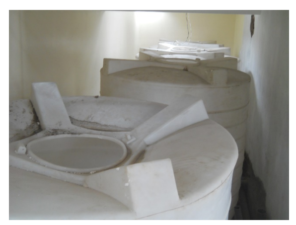
Five MEL filters in place.