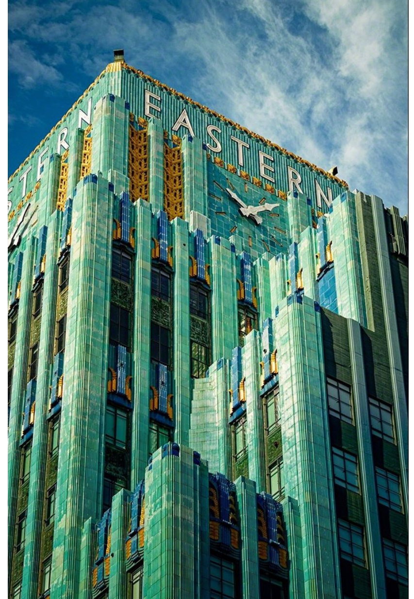
EMAC's Los Angeles office, the historic Eastern Columbia Building