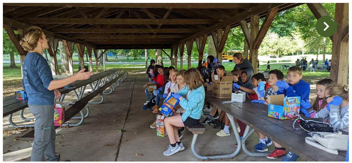
Indy Parks Education Event