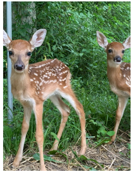
First time outside!

Luckily, thanks to expert care, they were able to be saved, and join our other fawns! At the end of summer, when they were an acceptable weight and age, we set our fawns up in a prerelease pen near a local wild herd of deer. Slowly, we acclimated them into the wild herd. We are happy to say that they have been spotted many times since they acclimated and are settling in well!