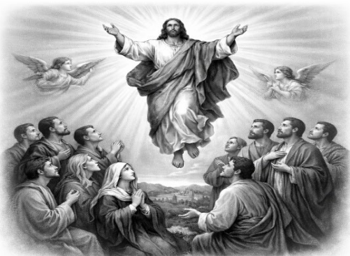
THE ASCENSION OF THE LORD