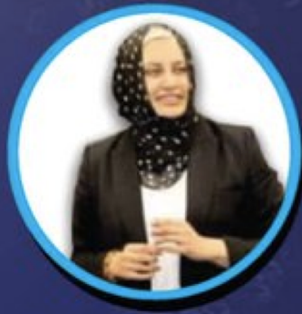
LYLAH LATIFF @LylaLatiff