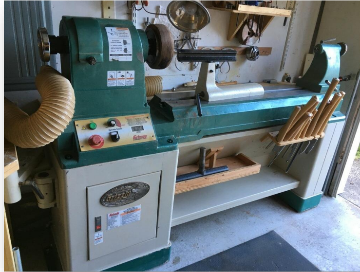
Grizzly lath G0694 with the gouges $2700.00

Contact Brian Harte at 360-606-7272 for the three items below: