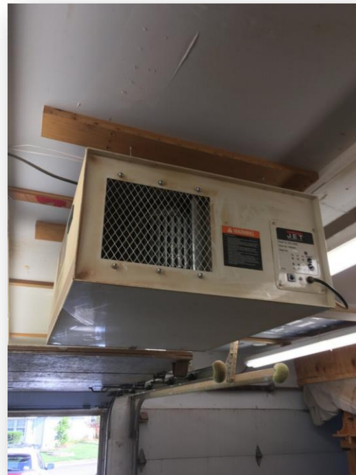
Jet overhead air filter AFS-1000B $300.00