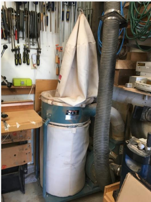
Jet dust collector DC-1200 2HP $350.00