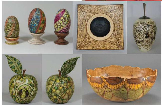
Location: Multnomah Arts Center, 7688 SW Capitol Hwy, Portland, OR 97219