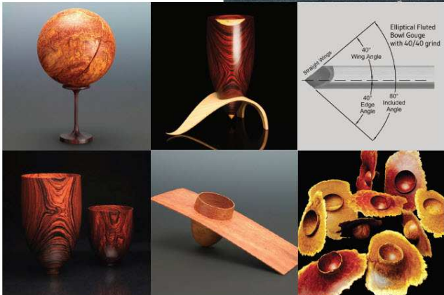
Location: Multnomah Arts Center, 7688 SW Capitol Hwy, Portland, OR 97219