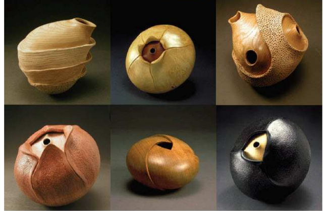
Location: Pacific Northwest Carpenters Institute ("PNCI"), 4222 NE 158th Avenue, Portland, Oregon 97230

The following demonstrators will be available at Northwest Woodturners in early 2020: