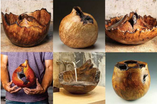
Location: Pacific Northwest Carpenters Institute ("PNCI"), 4222 NE 158th Avenue, Portland, Oregon 97230