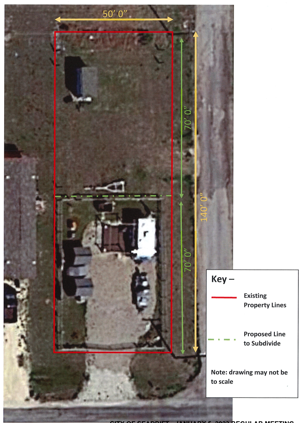
Exhibit B: Existing property lines and proposed property lines 1302 BILL TINDALL - SEADRIFT TOWNSITE, BLOCK 140, LOT 1

CITY OF SEADRIFT - JANUARY 5, 2023 REGULAR MEETING PAGE 9 OF 13