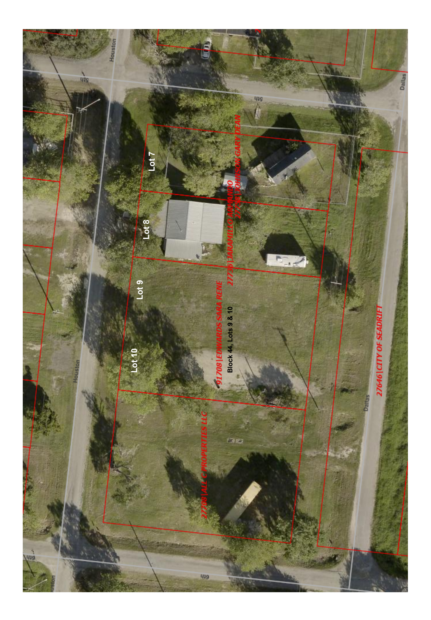
January 14, 2025, Regular Meeting - Page 42 of 95