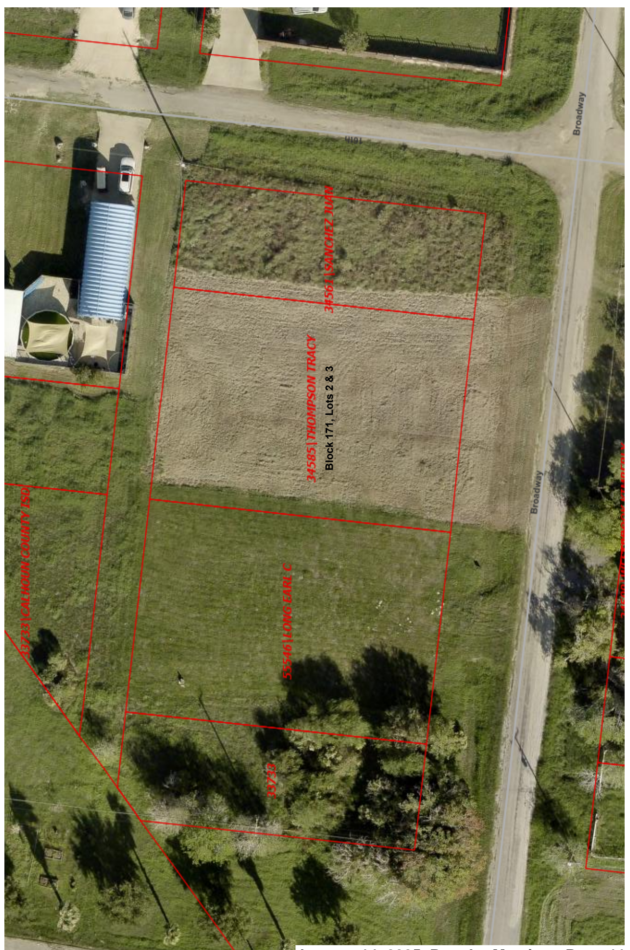
January 14, 2025, Regular Meeting - Page 44 of 95