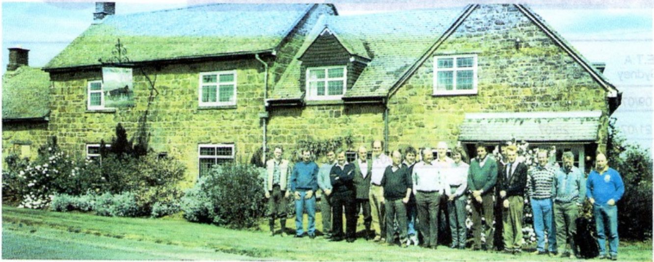
A well-earned break for lunch at the picturesque Wobbly Wheel pub after a morning of practice.

Teams were formed by customers and ACT(A) personnel and instruction was given in the morning by experts in the sport and members of the British National Team, with plenty of opportunity for practice. After lunch a competition was held between the teams and trophies were awarded to the overall winner and members of the winning team. A memento was given to all those taking part. The photographs below show some of the "action" during the day and at the presentation of awards.