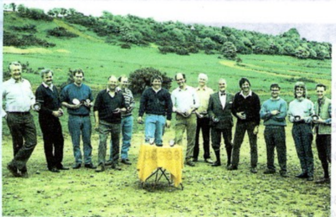
Trophies were awarded to the competition winners as well as mementos to all those taking part.