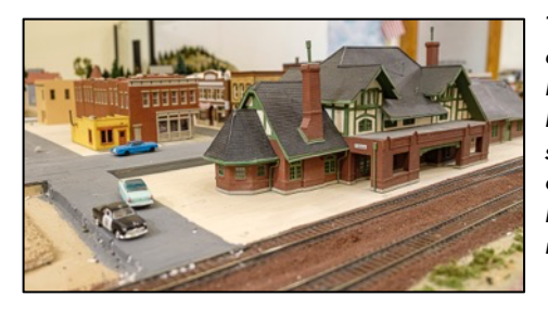
The city of Flagstaff has taken shape over the last few months.