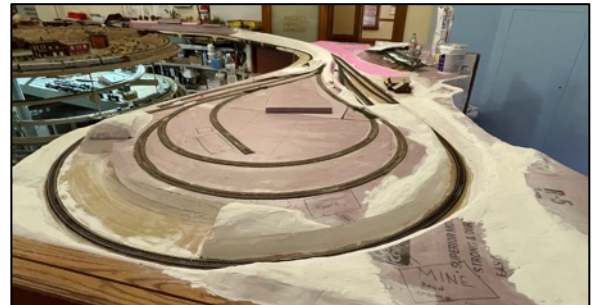
View of the top of the South Rim area shows the standard and narrow-gauge tracks laid out and the basic scenery installed.

The scenery focus continues at the Grand Canyon area of the layout with the standard gauge and narrow-gauge tracks laid out. The mountainous terrain is being added as well.