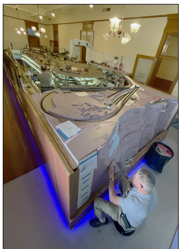
Ken Nelson carves the foam layer base of the south rim. By mid-July the plaster texture was applied. Final rock carving and color come next.