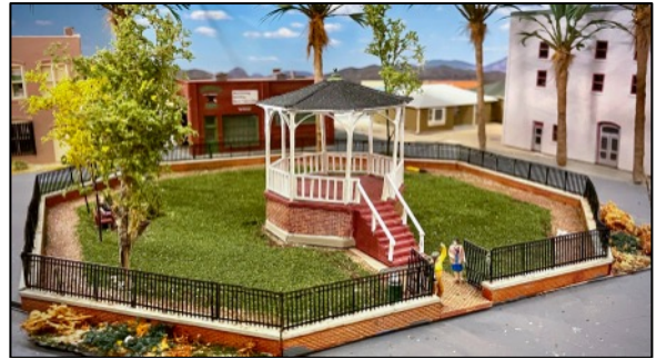
A park and Gazebo in the center of downtown Tucson