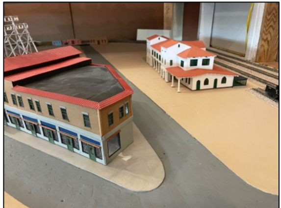
Two historic Tucson buildings, the Hotel Congress and the Tucson SP depot were completed and placed on the North end of the layout. Dave Irick scratch-built the structures.