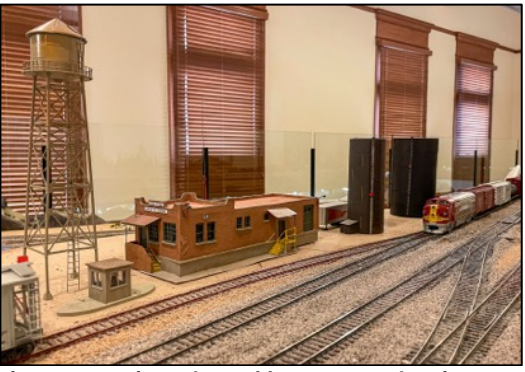
The ATSF Ash Fork yard begins to take shape on the upper level.