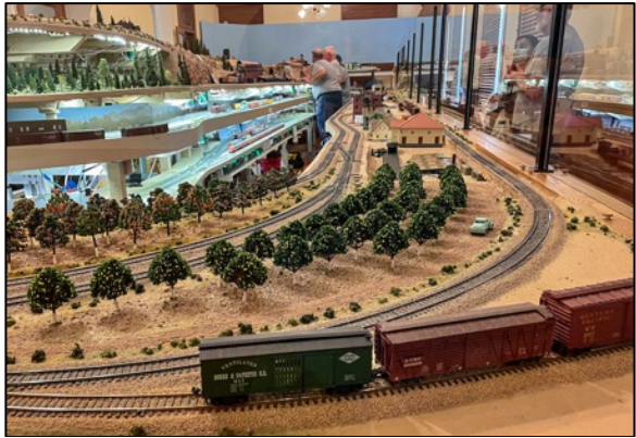
Citrus groves on the North end of the layout