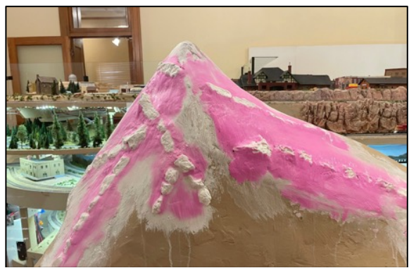
"A" Mountain in Tempe was detailed in March. The pink spackling compound will turn white when dry and will then be painted and detailed.