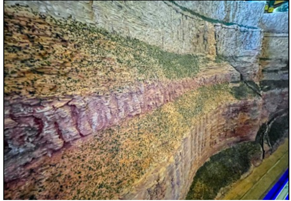
The completed Grand Canyon rock face shows the colors and geological details of the Canyon's strata.