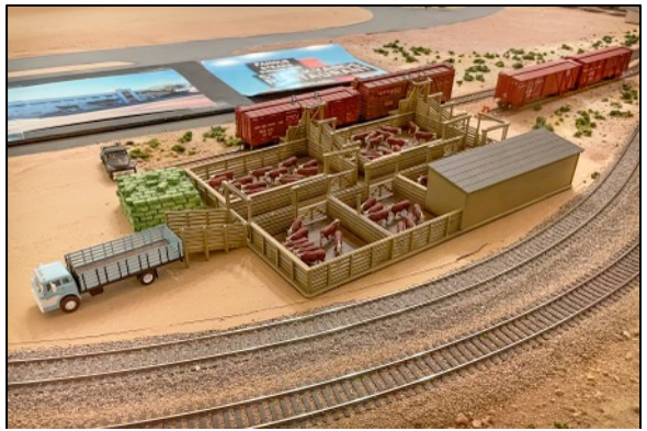
The stock yards, just south of downtown Phoenix. The location will include several iconic buildings: Tovrea Castle, Stockman's Restaurant and the Stockman's Savings and Loan.