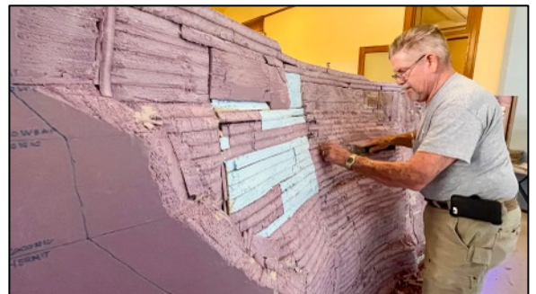
Ken Nelson took the lead in building the Grand Canyon South Rim scenery. Here, Ken puts the finishing touches on the Styrofoam substructure of the Canyon.