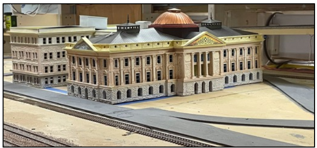
The Arizona State Capitol building model was completed by Wayne Weslowski and placed on the layout in January. The highly detailed model was scratch built. Construction took over a year.