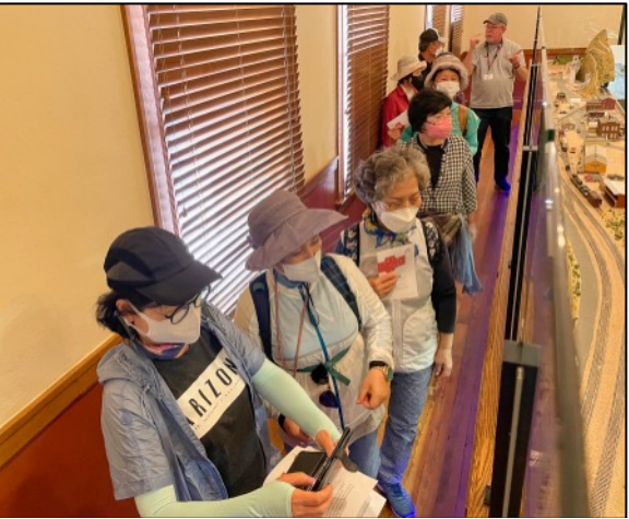
A tour group visits the exhibit.