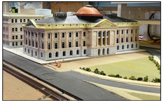
By April, sidewalks and ground cover had been added to the Capitol grounds.