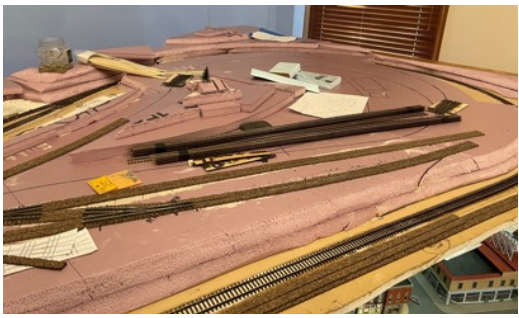
Preparations for laying the narrow-gauge track were being made at the end of May.