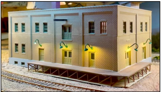
The first test building for John Mick's Arduino controlled lighting system. The system will cycle through a 24-hour day in twenty minutes. Individual lights can be programmed to cycles on and off throughout the day.