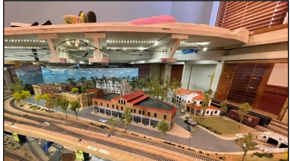
Tucson is virtually complete by the middle of July2022. Ken reinstalled the buildings and added thedetails.