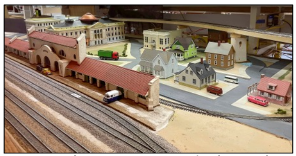
Downtown Phoenix continues to take shape with houses and business located in front of the Capitol.