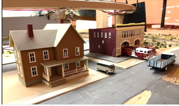
By March, roads were completed in Phoenix and building locations were planned.