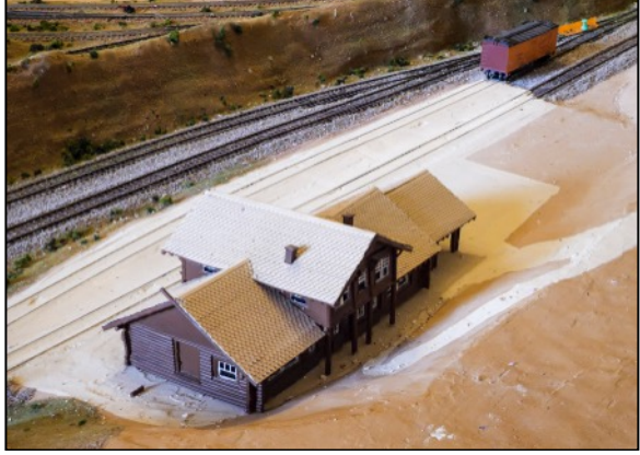
By year's end The Grand Canyon railway depot at the south rim of the Grand Canyon was in place.