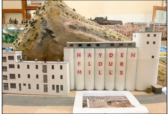
Dee Koltin's model of Hayden Flour Mills stands below the completed "A" Mountain in Tempe.