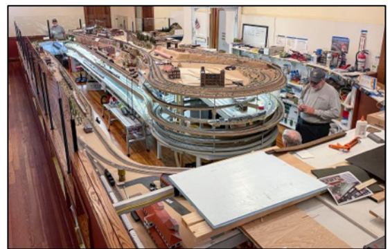
Layout from the South end, showing the future Grand Canyon plateau in the foreground