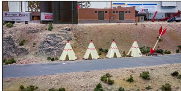
A Teepee tourist attraction along Route 66 between Williams and Flagstaff.